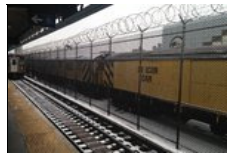
Image 142123 (428k, 1044x788) Location: East 180th Street Yard