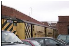
Image 76058 (186k, 1044x788) Location: 207th Street Yard