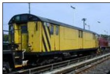
Image 7269 (51k, 800x600)

Location: Coney Island Yard