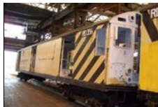
Image 79802 (224k, 1044x788) Location: 207th Street Shop