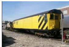
Image 100374 (253k, 1044x788) Location: 207th Street Yard